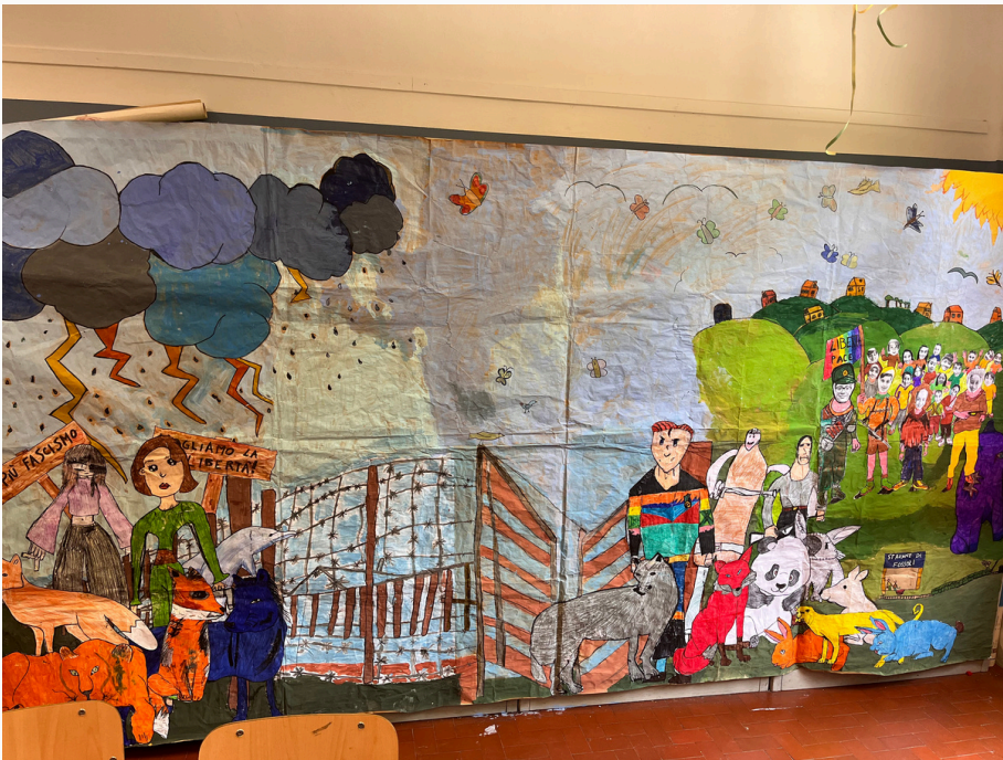
image taken from the workshop with the primary school in Bologna

Then the teacher worked with the children on the theme of resistance and liberation, and the children made a large drawing in which they decided to represent liberation from their perspective, drawing themselves as partisans and ambassadors of freedom