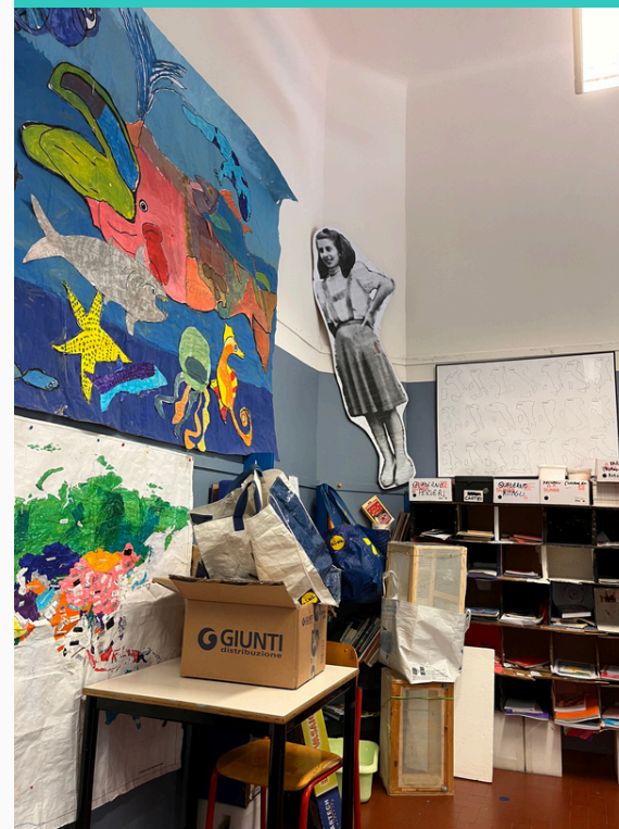
image taken from the workshop with the primary school in Bologna