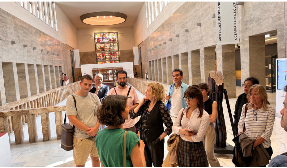
visit at the MUCIV (Museo delle Civiltà) in Rome